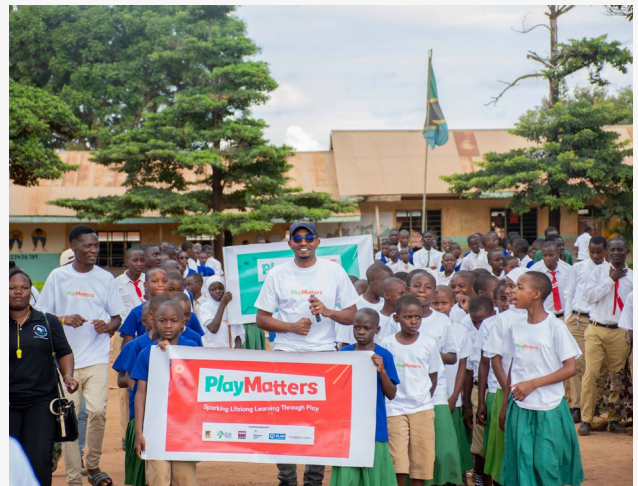
In May, PlayMatters Tanzania participated in the Global Action Week for Education. The team used the event as a platform to showcase Learning through Play methodologies.