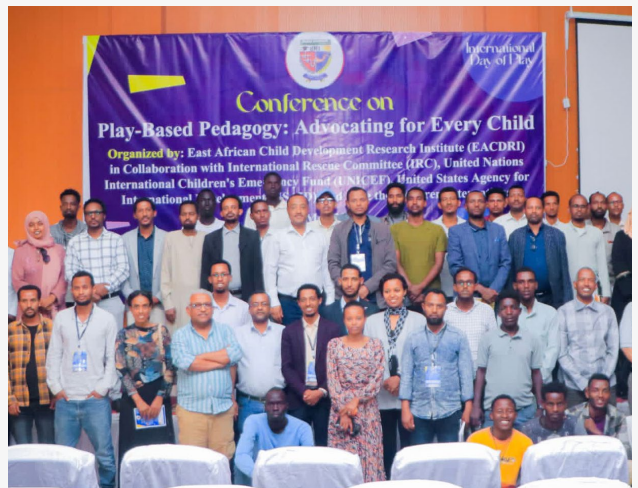
PlayMatters Ethiopia celebrated Day of the African Child while conducting a national research conference in collaboration with Jigjiga University in May. The theme of the day was, Play-Based Learning: Advocating for Every Child.