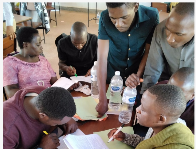
Following a school quality assessors supportive visit in May, PlayMatters Tanzania has conducted a teacher refresher training to fill the gaps identified to ensure teachers improve their Learning through Play practice in class.