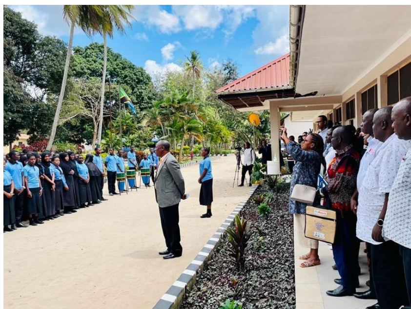
A photo from last year's system actors workshop. Dar es Salaam, Tanzania, 2023

The two-day conference will reflect on the different policy engagements that PlayMatters has collaborated with these Ministries and other humanitarian actors to create an enabling environment that links policy to practice. This is ultimately geared towards improving the quality of teaching and learning for ECD and primary Education, in host and refugee settings and, for the integration and adaptation of learning through play methodology within national and humanitarian systems.