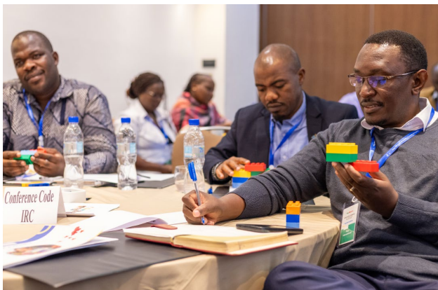
PlayMatters staff take part in a Six Bricks activity during the conference.