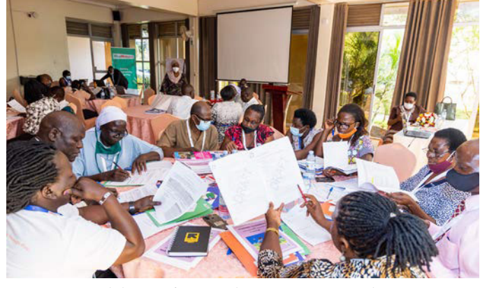
Participants from various departments in the Uganda Ministry of Education during a PlayMatters content review and validation workshop. Jinja, Uganda, December 2021