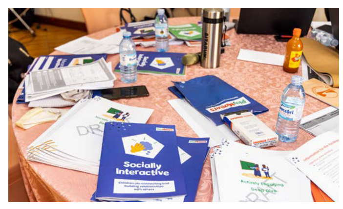
PlayMatters Learning through Play resources for teachers.