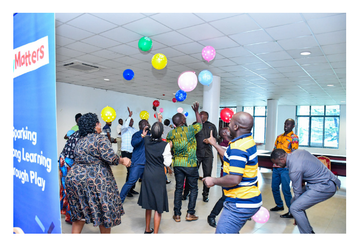
TIE officials take part in a mindfulness session as one of the activities teachers can use during a lesson in Kigoma.

PlayMatters Tanzania co-created, piloted and refined teacher-facing content with the Tanzania Institute of Education (TIE) and other system actors. This includes a Facilitator's Manual, Teachers' Resource Book, and a Game Collection Book. TIE expects the approved materials to be uploaded into the Learning Management System (LMS) to be accessed by all teachers in the country.