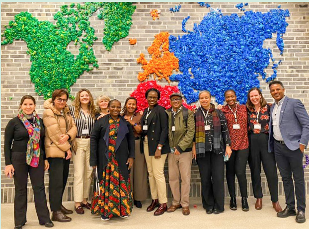
The leadership group takes a group photo at the LEGO Foundation offices in Billund.