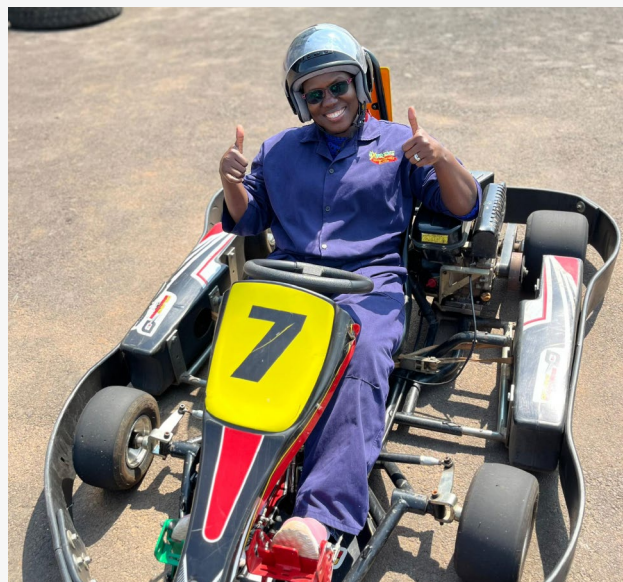
Thoughts from some of the team members.

The day was packed with thrilling activities, including Ziplining, Go-Karting, Archery, and Quad Biking. These games fostered collaboration, joy, and an appreciation of teamwork among participants.