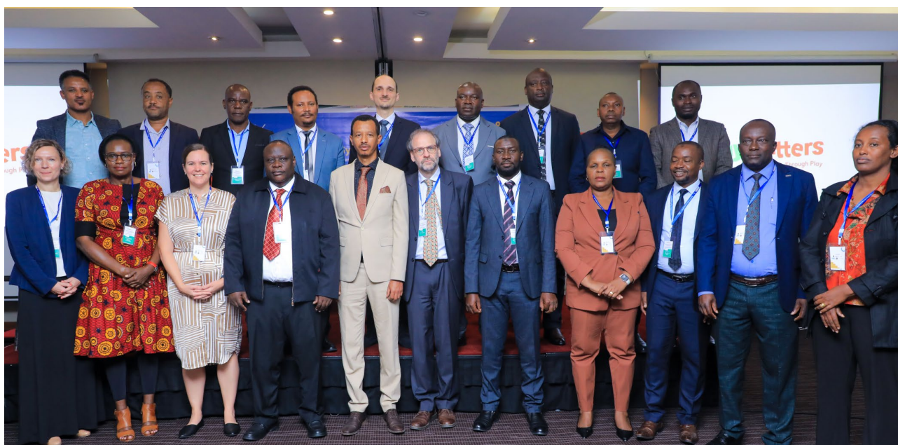
Ministry of Education Officials from Ethiopia, Uganda and Tanzania join the PlayMatters team for a group photo at the start of the Regional System Actors conference in Addis Ababa, Ethiopia.

The PlayMatters Regional System Actors Conference, held in August in Addis Ababa, Ethiopia, marked a pivotal moment in the PlayMatters journey of transforming education through Learning through Play (LtP) in East Africa. Under the theme, “Achieving Quality Education by