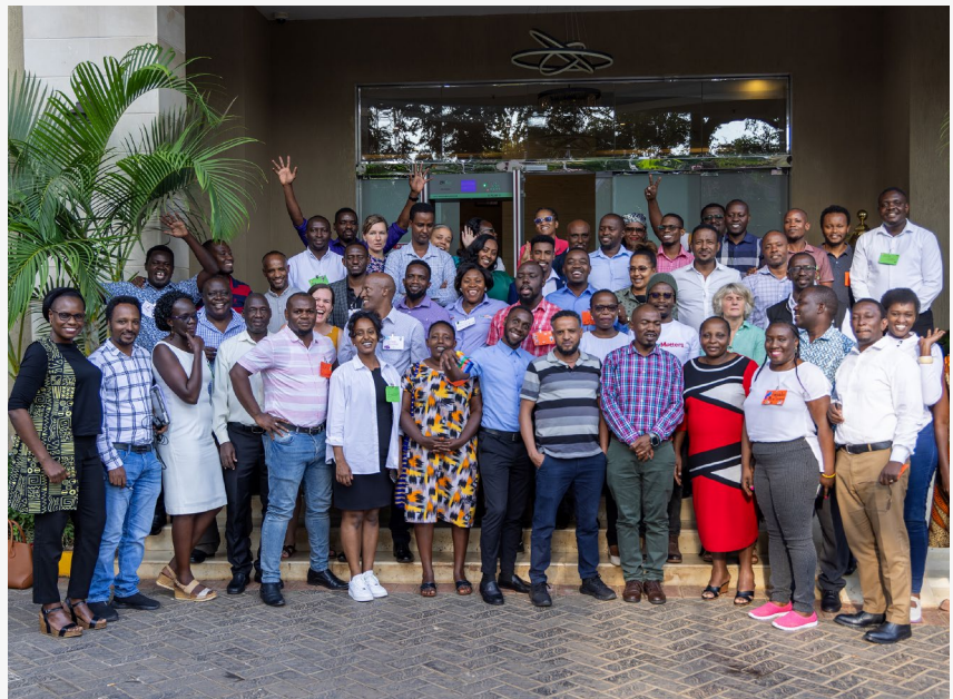
A photo from the recent workplanning. Kampala, Uganda, 2024

The planning for 2025 will be on transition and closeout.